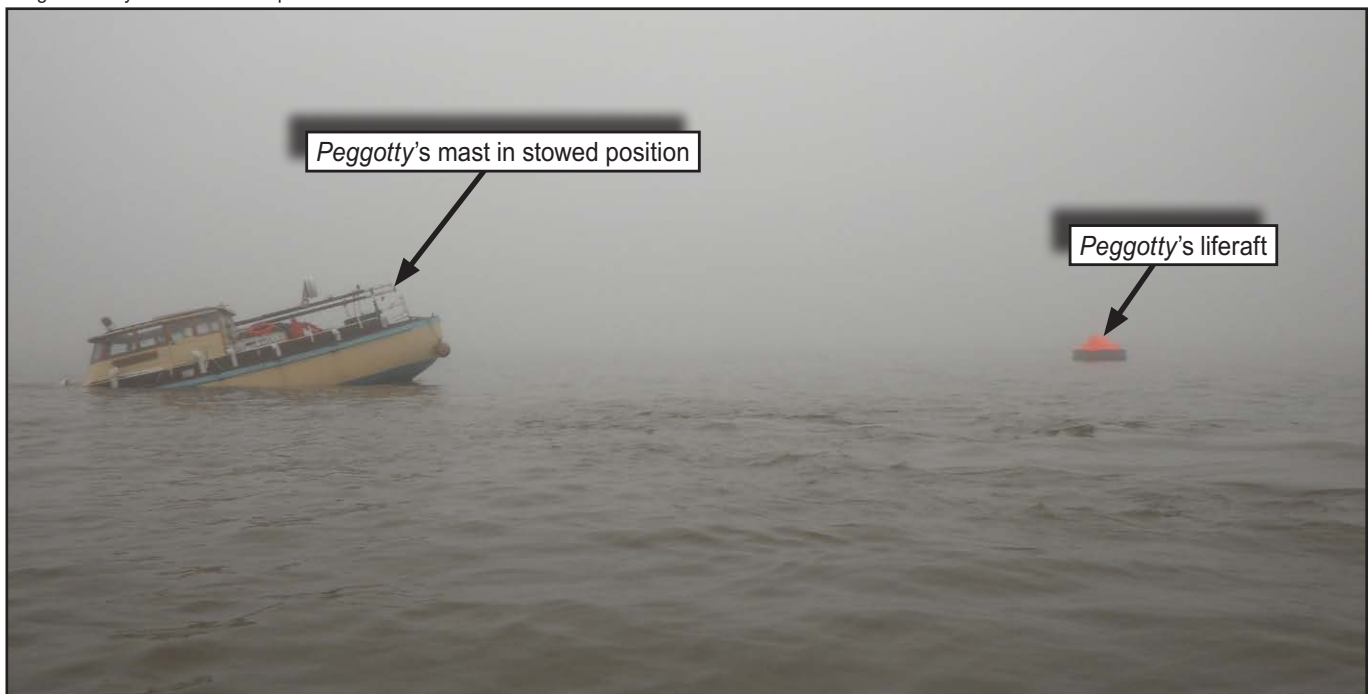
Figure 1: Peggotty following the collision (note: stowed mast and deployed liferaft)

At about the same time loading operations had been completed on board the Danish registered roro freight ferry Petunia Seaways , which was secured alongside its berth within the Outer Harbour at Immingham. The ferry operated a regular route between Immingham and Gothenburg and, although it was not scheduled to depart until 0500, it was not unusual to leave early if all the cargo was on board.