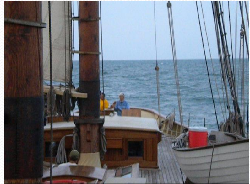
Penny, age 80+, at the helm.