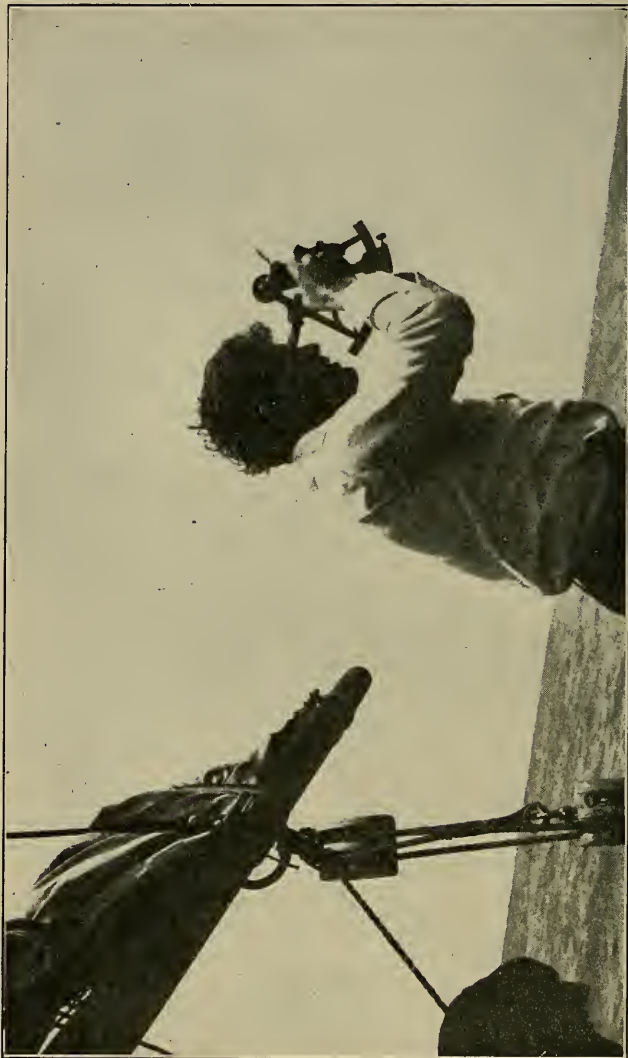
The Dark Secrets of Navigation.