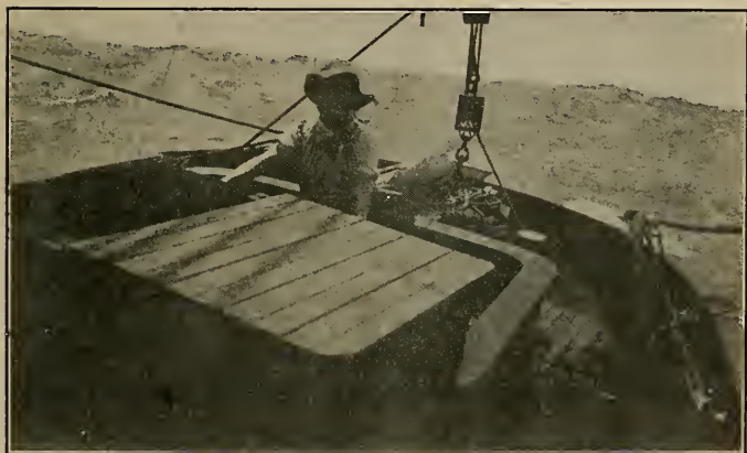
A Big Wave that is liable to steal the Horizon Away.