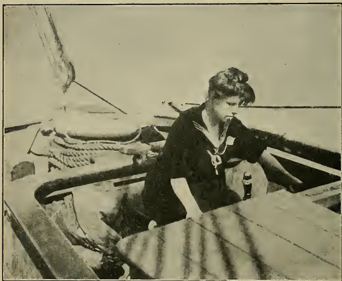
Doing her Trick.